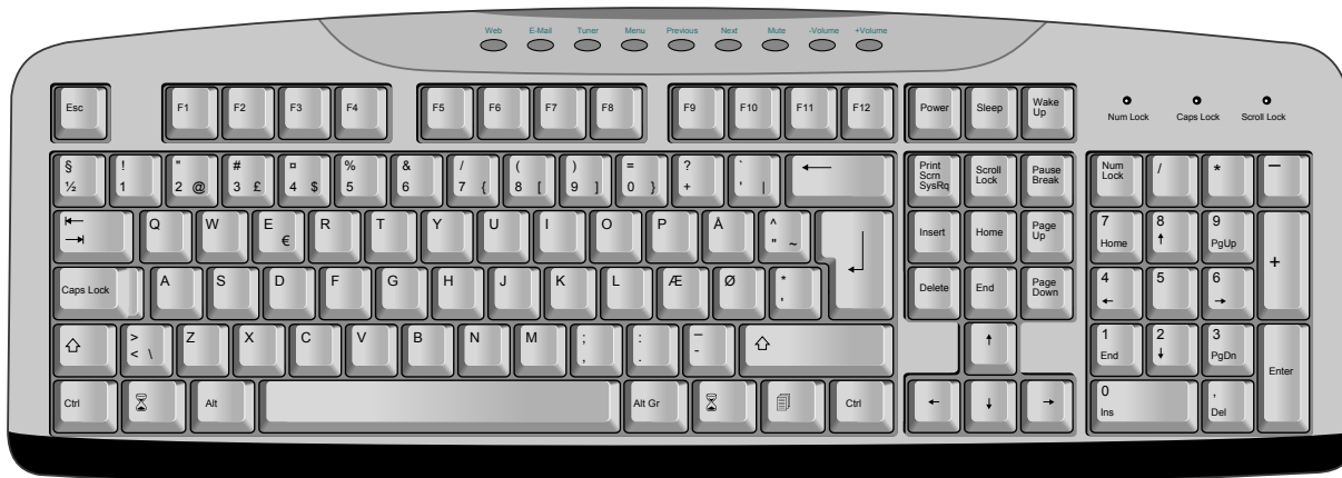
Figure 2: This figure floats to the top of the page, spanning both columns.